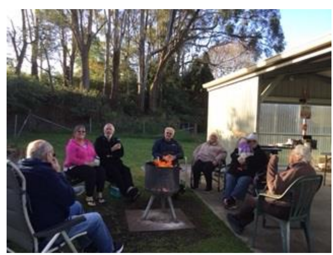
Figure 1: Happy hour at CMCA RV Park Railton

If you do receive a request for a vehicle to be stored at one of our parks, please advise that this is not possible, and if you want this decision to be backed up, please refer them to NHQ.